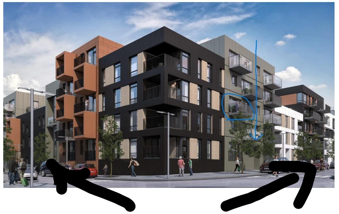
Fálkahlíð where the deep containers for garbage are