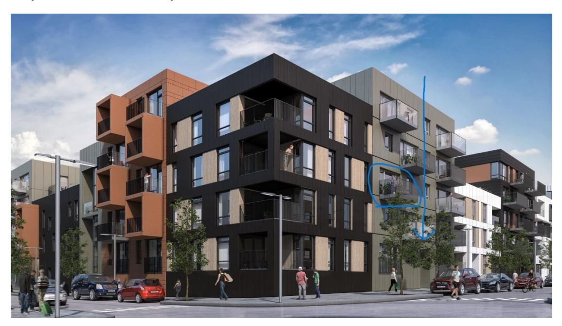
Valshlíð – where the parking garage is